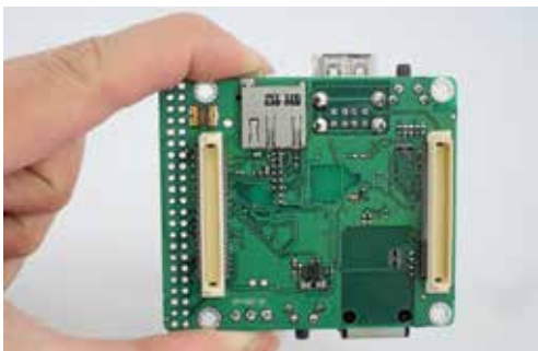
piA-AM335x-SK (Starter kit)