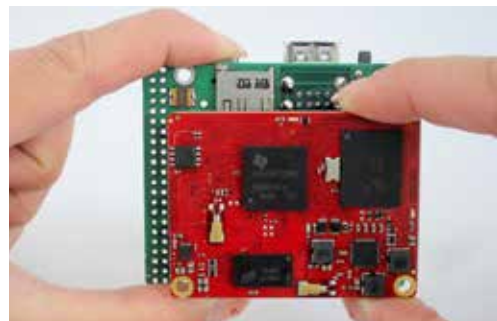
piA-AM335x-SK (Starter kit) and piA-AM335x-PM (Processor module)